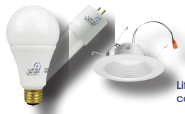
Life Lamp Detector comes in many styles